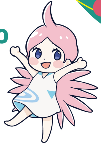
Shikokukotsu's mascot Yumemi

Available on weekend & holidays, April to November 2025