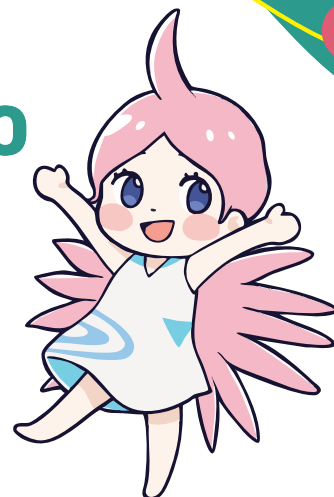
Shikokukotsu's mascot Yumemi

Available on weekend & holidays, April to November 2025